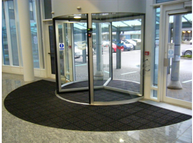
DIAMOND installation incorporating curves and revolving door.

DIAMOND entrance matting modules are manufactured to ISO9002 and conform to current BS8300 DDA regulations.